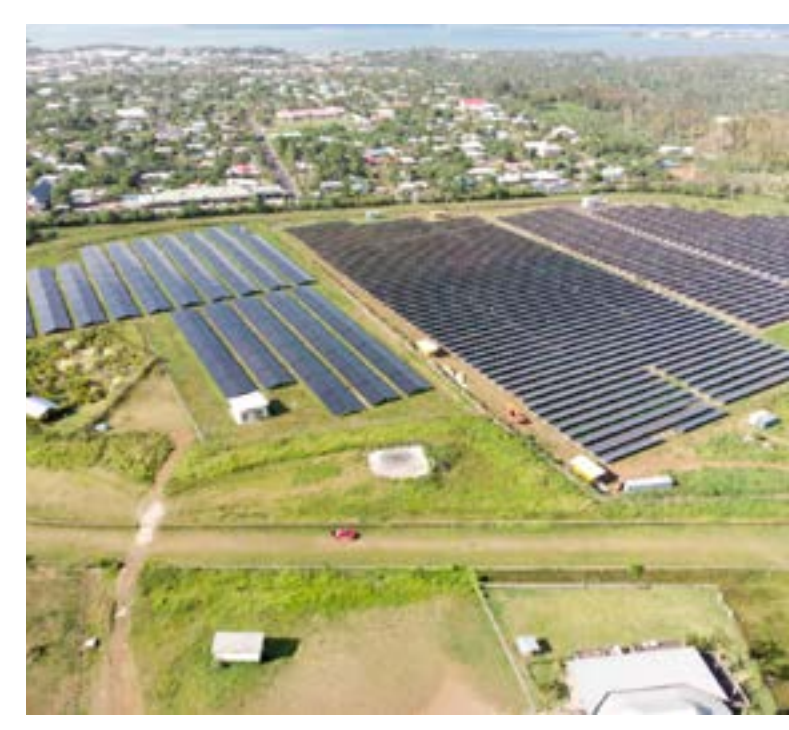
Solar farm, Samoa.

In 2014, the Pacific Ministers of Energy and Transport endorsed the establishment of a regional centre of excellence, the Pacific Centre for Renewable Energy and Energy Efficiency (PCREEE), under the umbrella of the FAESP. PCREEE was inaugurated in April 2017.<sup>3</sup> To support efficient coordination of efforts, project investments are streamlined through the Pacific Renewable Energy Investment Facility, with current operation extending through 2021.