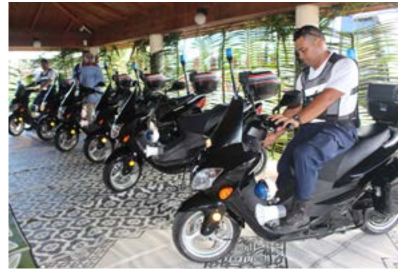
Electric Vehicles for Sustainable Transport, Samoa.

That said, efforts are underway to improve reporting and, with sustained support for long-term monitoring, data confidence will grow quickly.