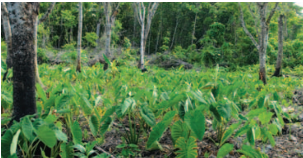
Taro plantation near forest margin