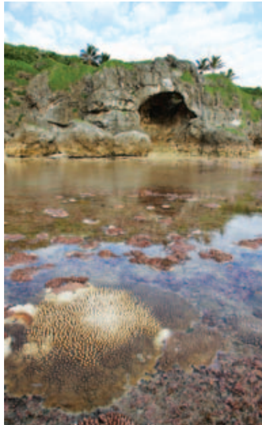
Coral bleaching – Tautu, Liku