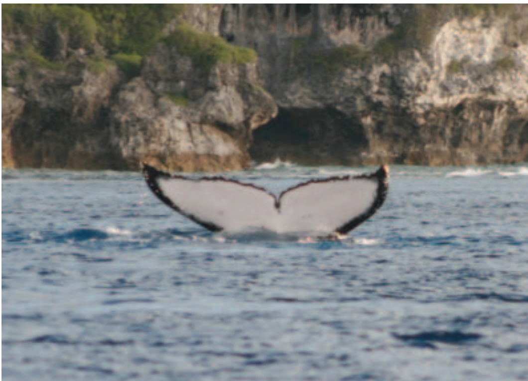
Tail fluke of humpback whale