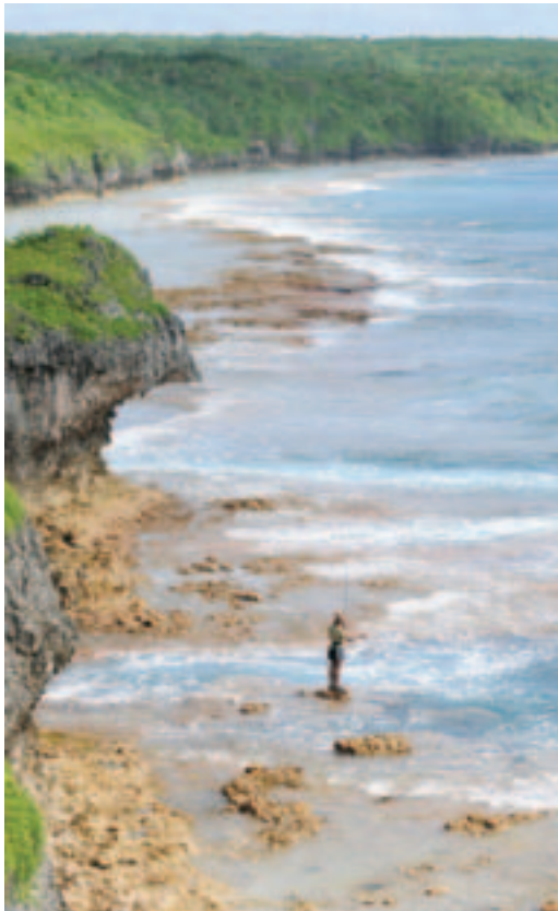
Fringing reef