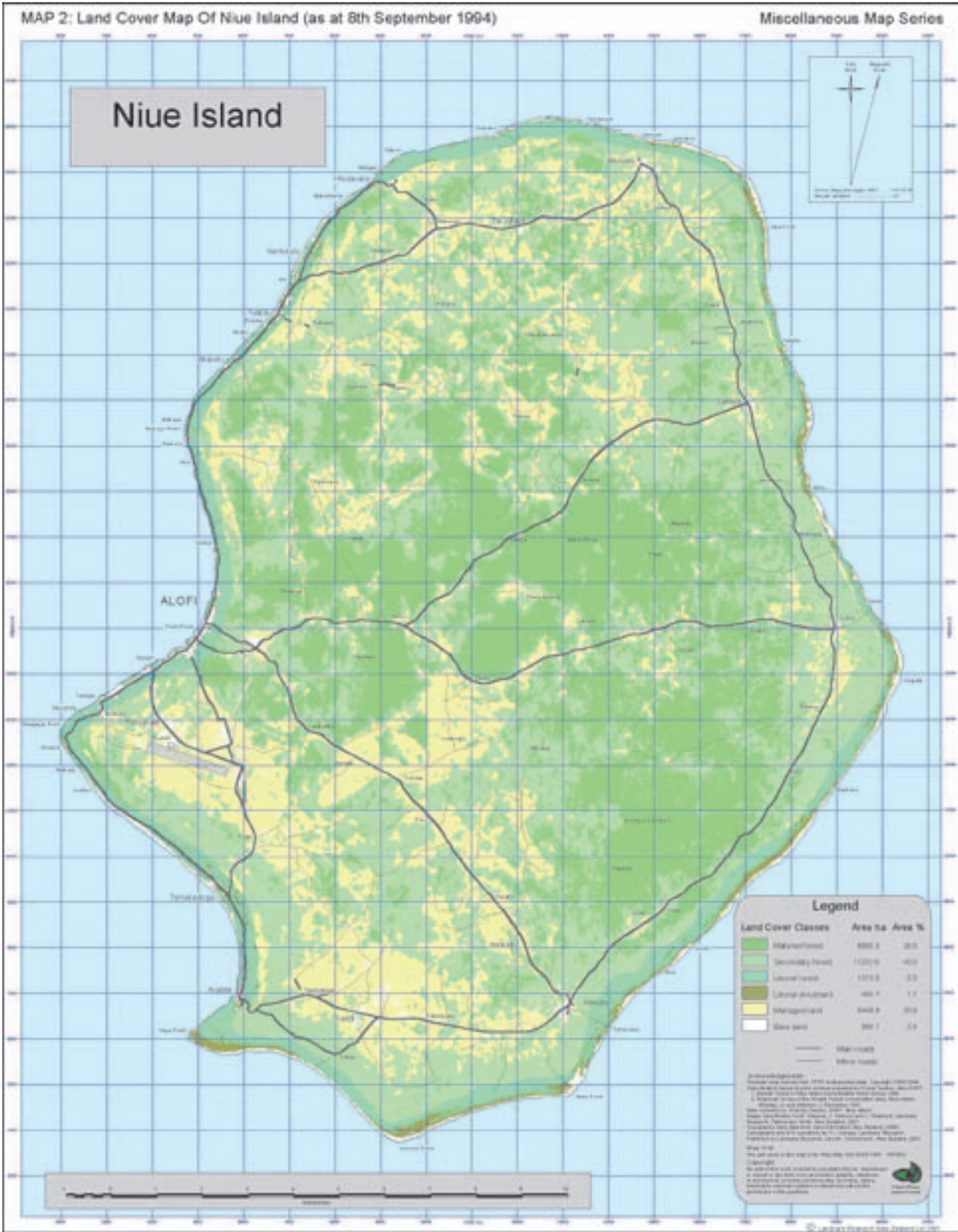
Figure 2 Land cover map of Niue