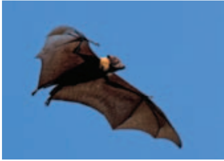
Tongan flying fox, peka