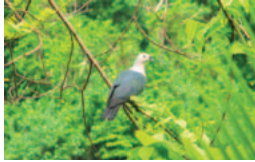
Pacific pigeon