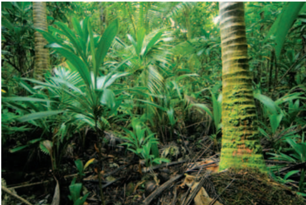
Coastal forest